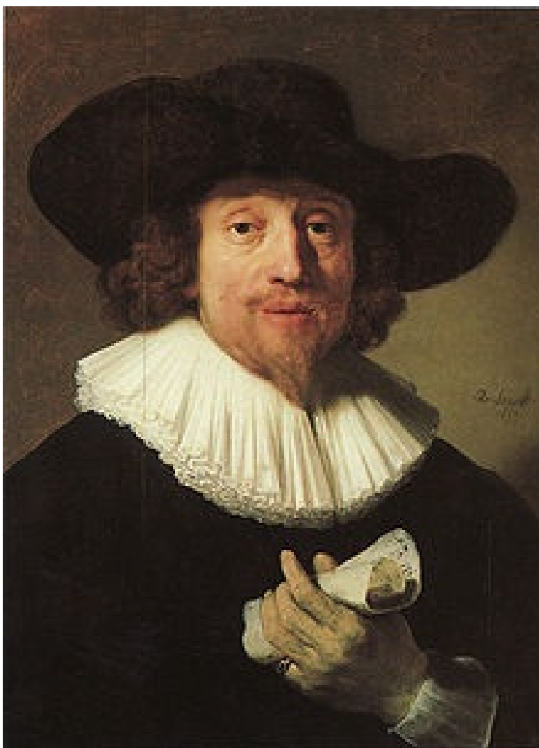
Heinrich Schütz par Rembrand

(né à Köstritz le 8 Octobre 1585 - mort à Dresde le 6 Novembre 1672) En latin Henricus Sagitarius est un compositeur Allemand représentatif du premier baroque allemand, aux côtés notamment de Samuel Scheidt et de Johann Hermann Schein. Il est généralement considéré comme le plus grand musicien allemand antérieur à Johann Sebastian Bach, et l'un des plus importants de la musique occidentale au XVIIe siècle avec Claudio Monteverdi