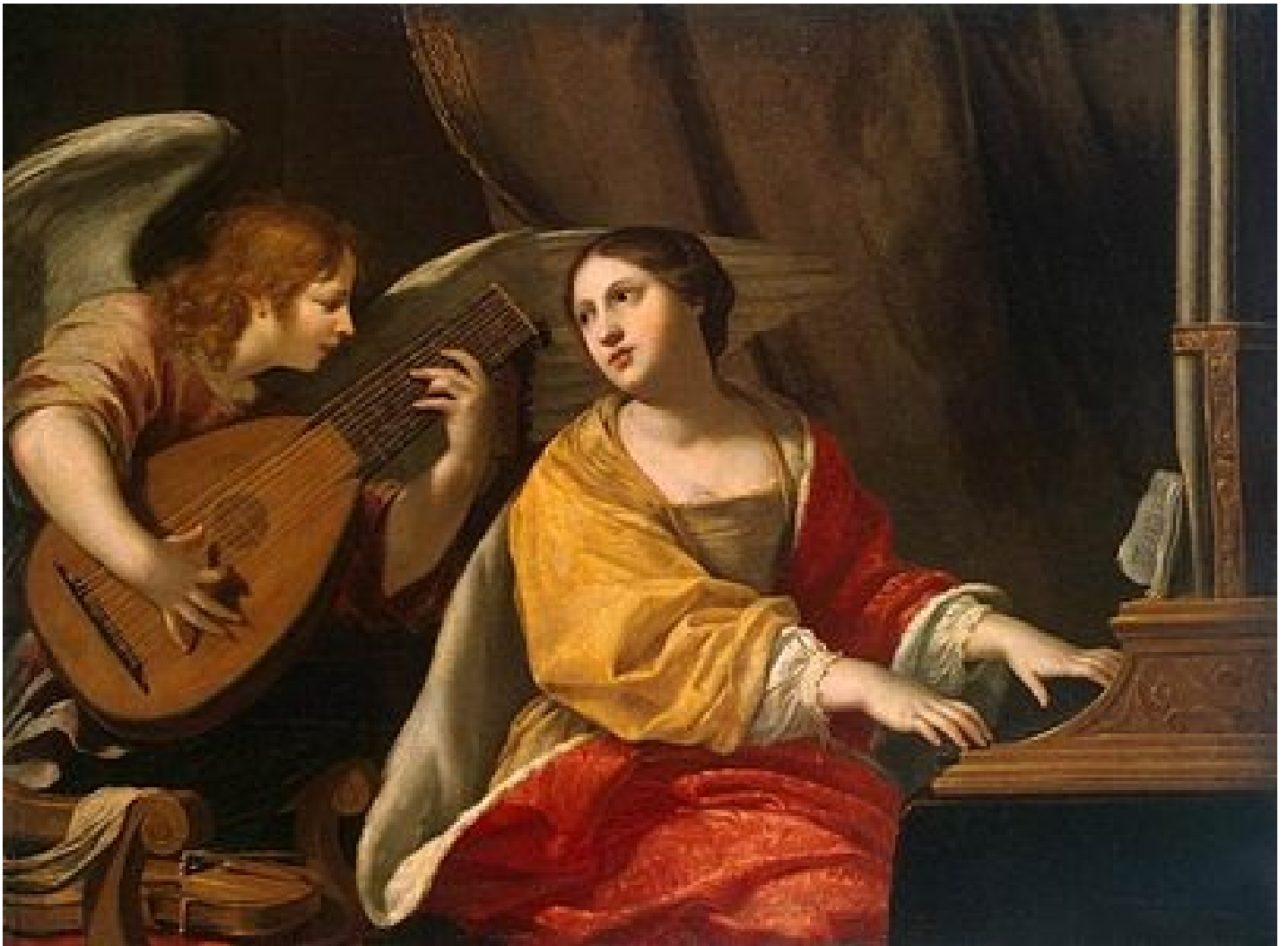
Jacques Blanchard (Paris 1600 - 1638) Sainte Cécile

Motet pour chœur, solistes, ensemble instrumental et continuo.